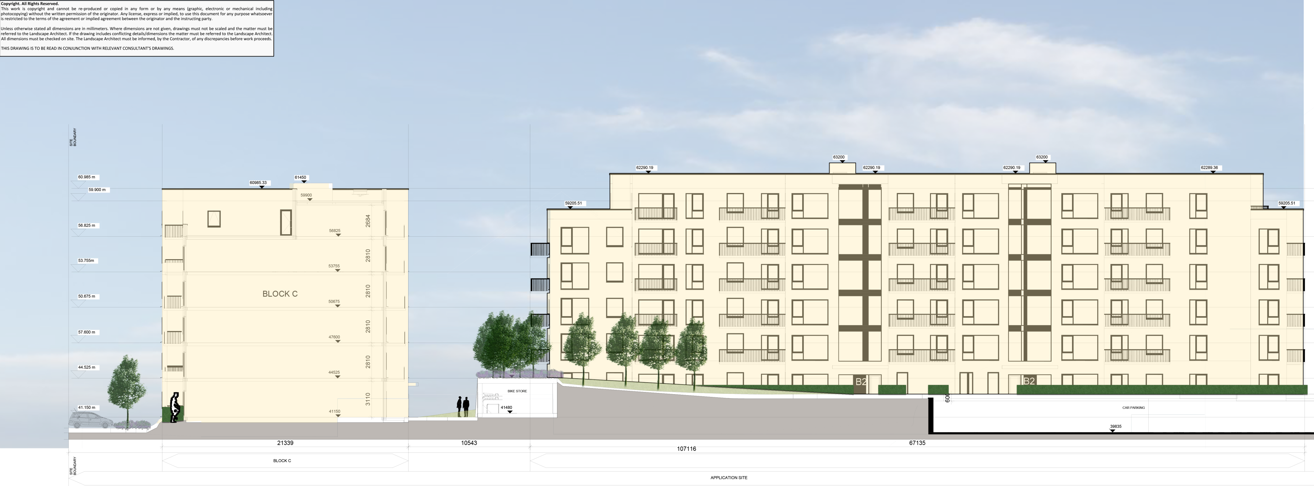
01 | Landscape Section 01 Sectional Elevation Scale 1:200

Copyright: All Rights Reserved. This work is copyright and cannot be reproduced or copied in any form or by any means (graphic, electronic or mechanical including photocopying) without the written permission of the originator. Any license, express or implied, to use this document for any purpose whatsoever is restricted to the terms of the agreement or implied agreement between the originator and the instructing party. Unless otherwise stated all dimensions are in millimeters. Where dimensions are not given, drawings must not be scaled and the matter must be referred to the Landscape Architect. If the drawing includes conflicting details/dimensions, the matter must be referred to the Landscape Architect. All dimensions must be checked on site. The Landscape Architect must be informed, by the Contractor, of any discrepancies before work proceeds. THIS DRAWING IS TO BE READ IN CONJUNCTION WITH RELEVANT CONSULTANT'S DRAWINGS.