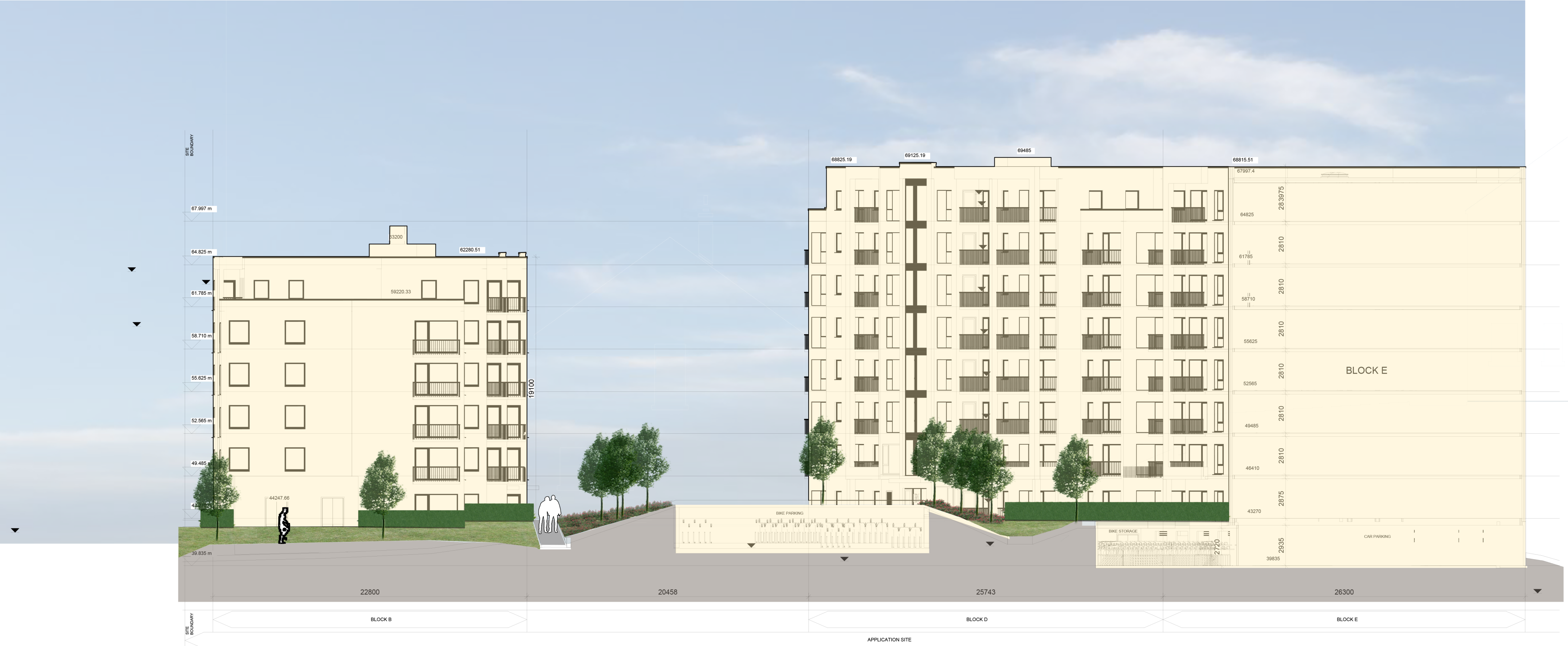
02 | Landscape Section 02 Sectional Elevation Scale 1:200