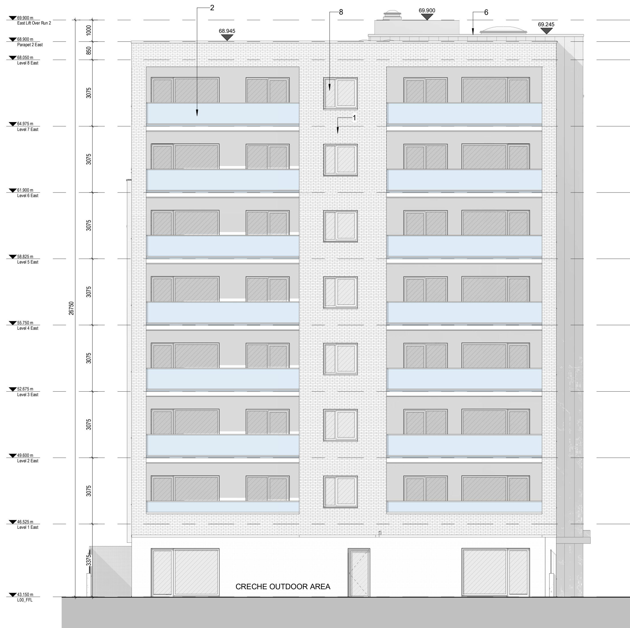
1 GA - East Elevation