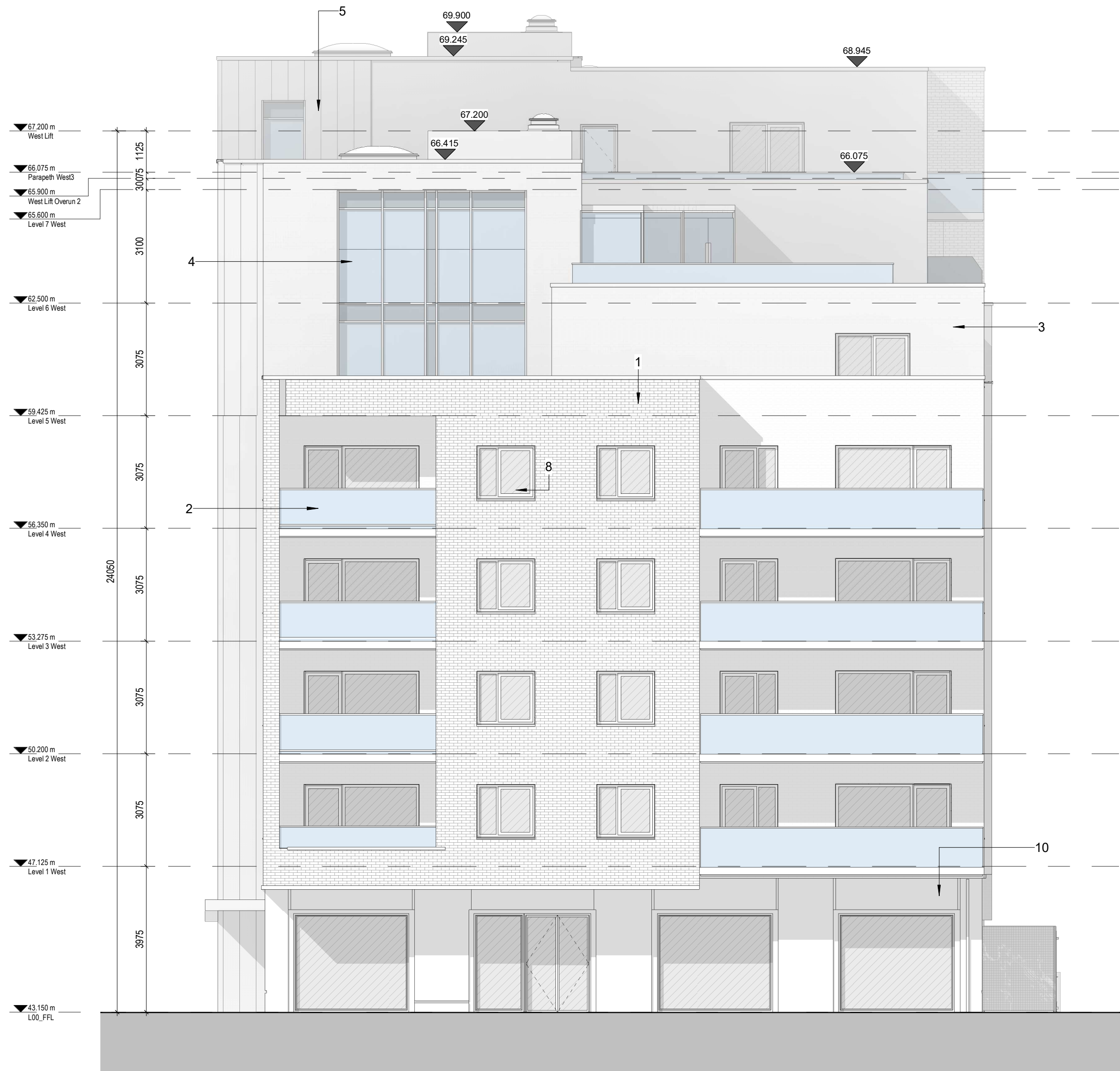
2 GA - West Elevation