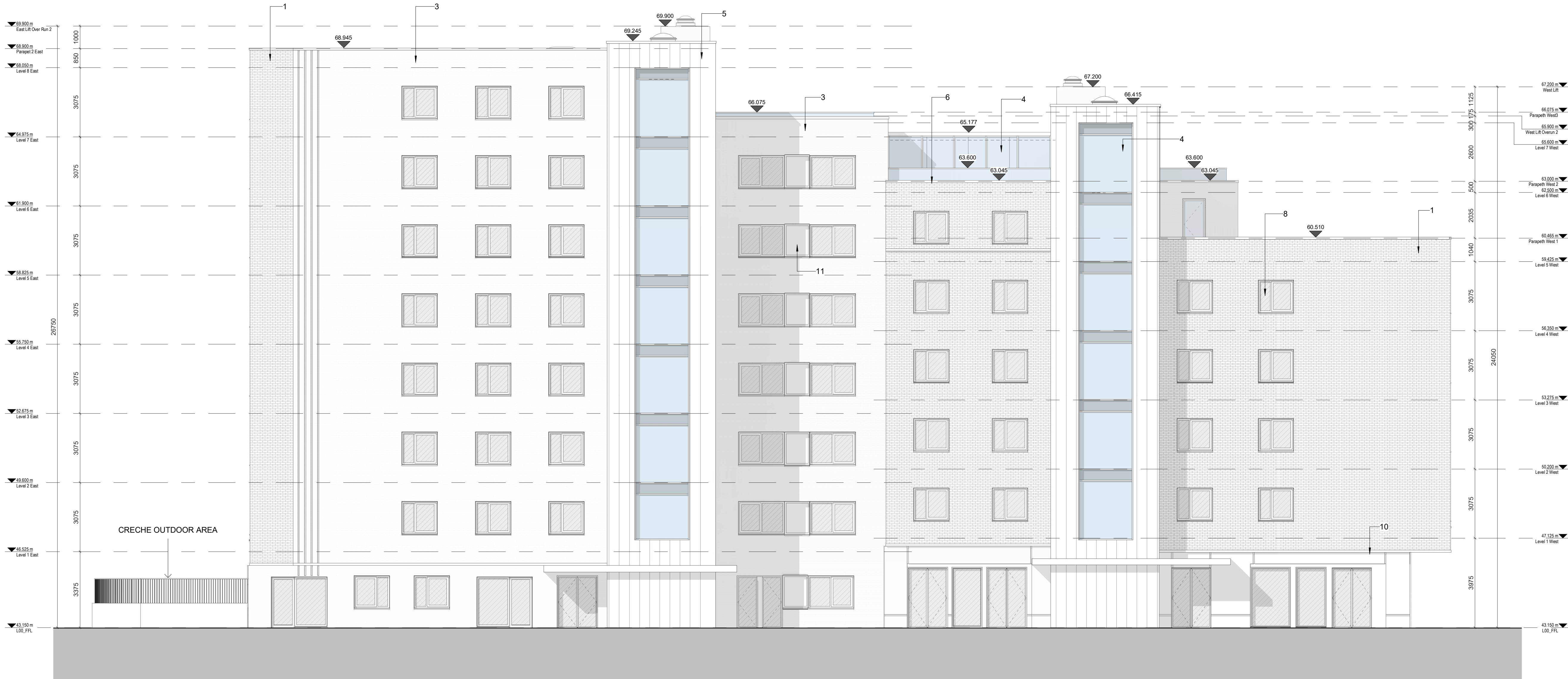
1 GA - North Elevation