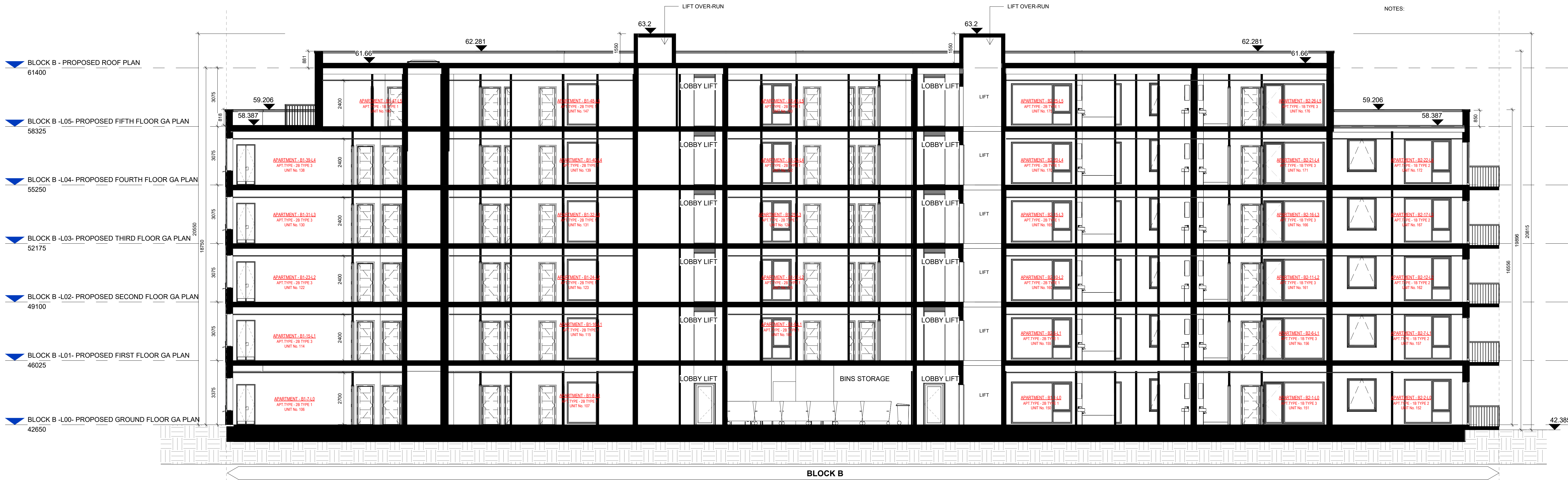
A BLOCK B - PROPOSED SECTION A-A