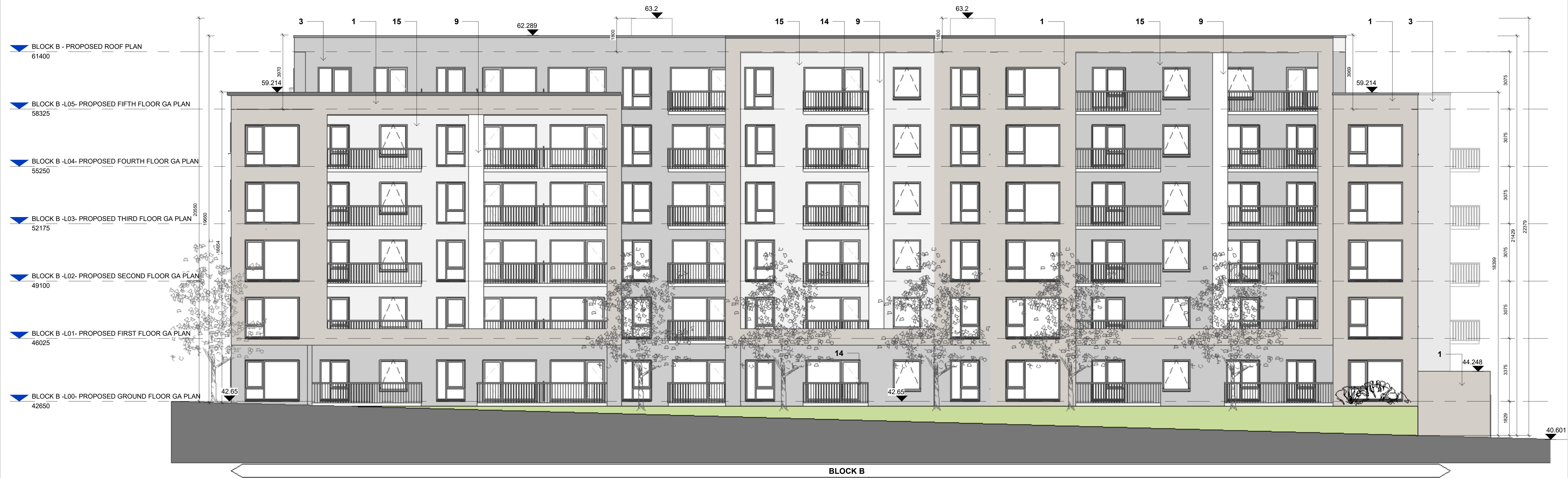
1 BLOCK B - PROPOSED WEST ELEVATION 1 : 100