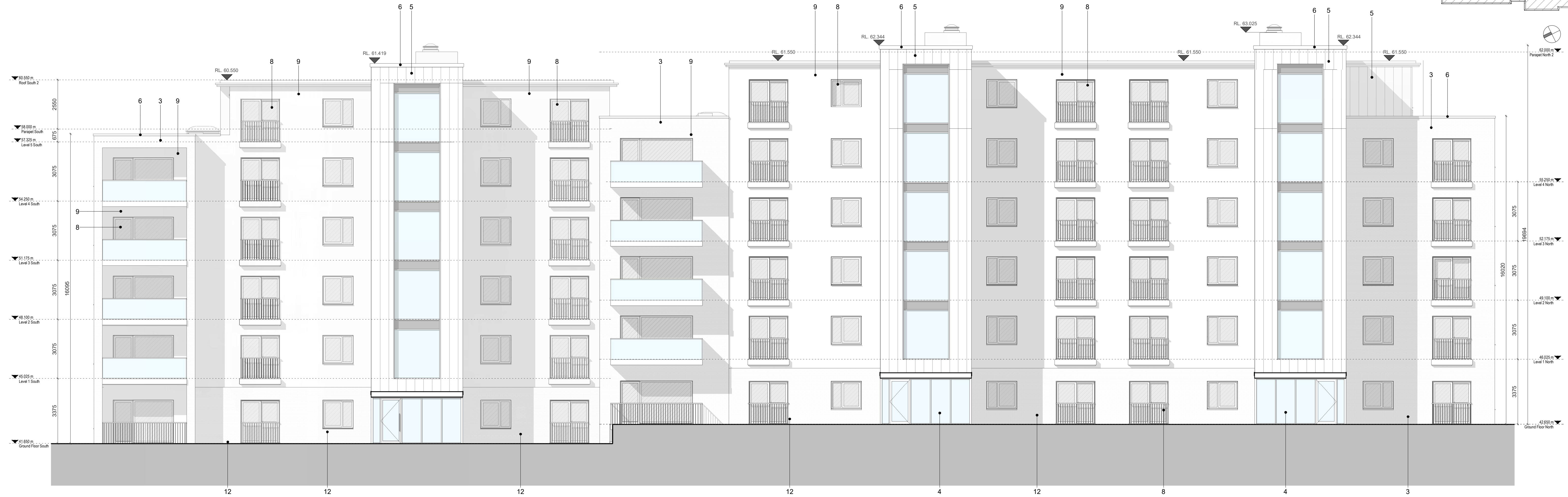
1 GA - East Elevation