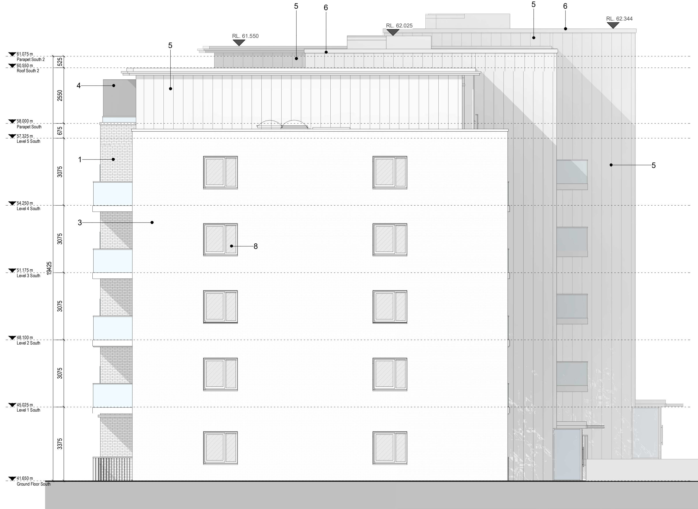
2 GA - South Elevation