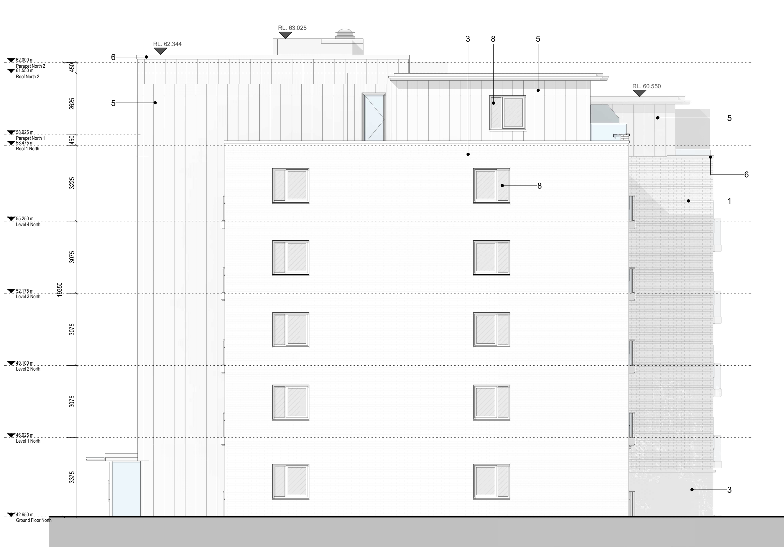
1 GA - North Elevation