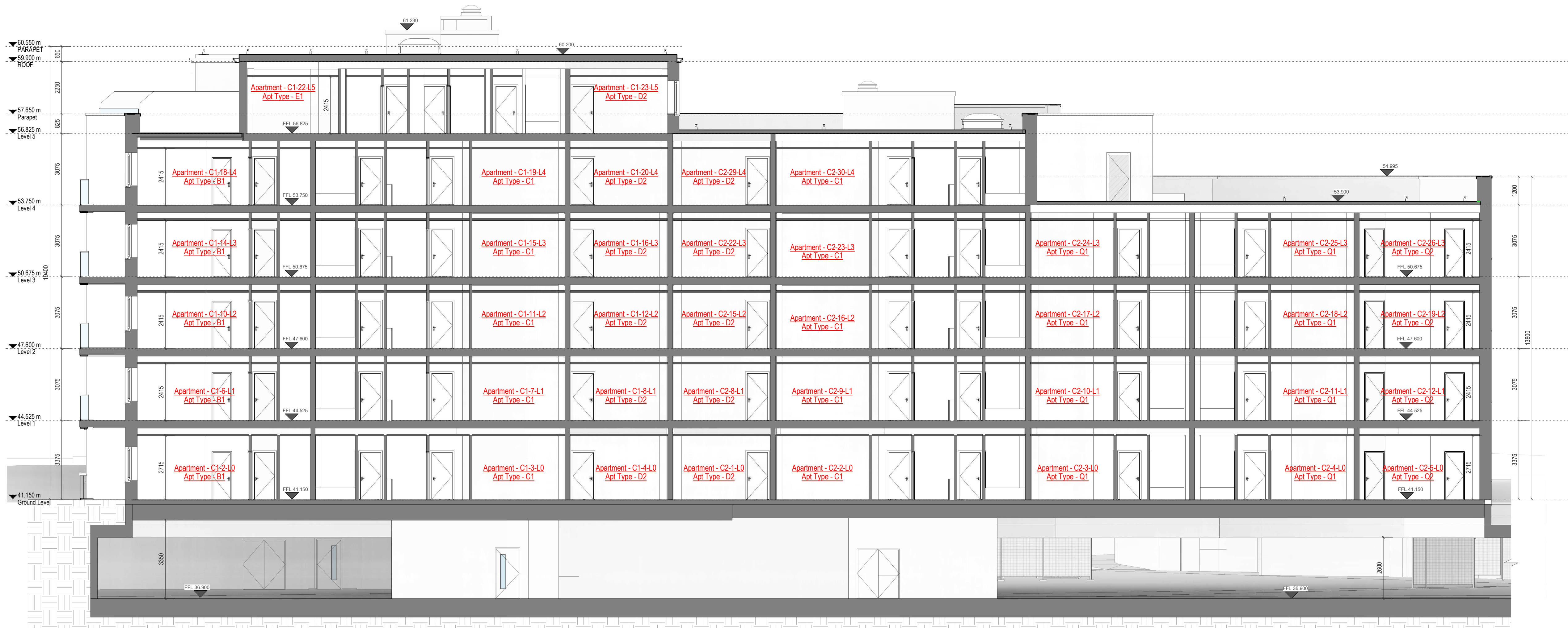
1 GA - Section AA 1 : 100

PERMITTED SHD (Subject To Conditions) Reg Ref: ABP-313289-22