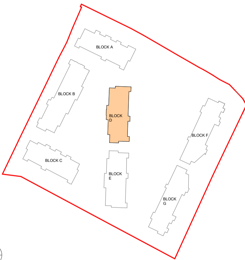
Key Plan NTS