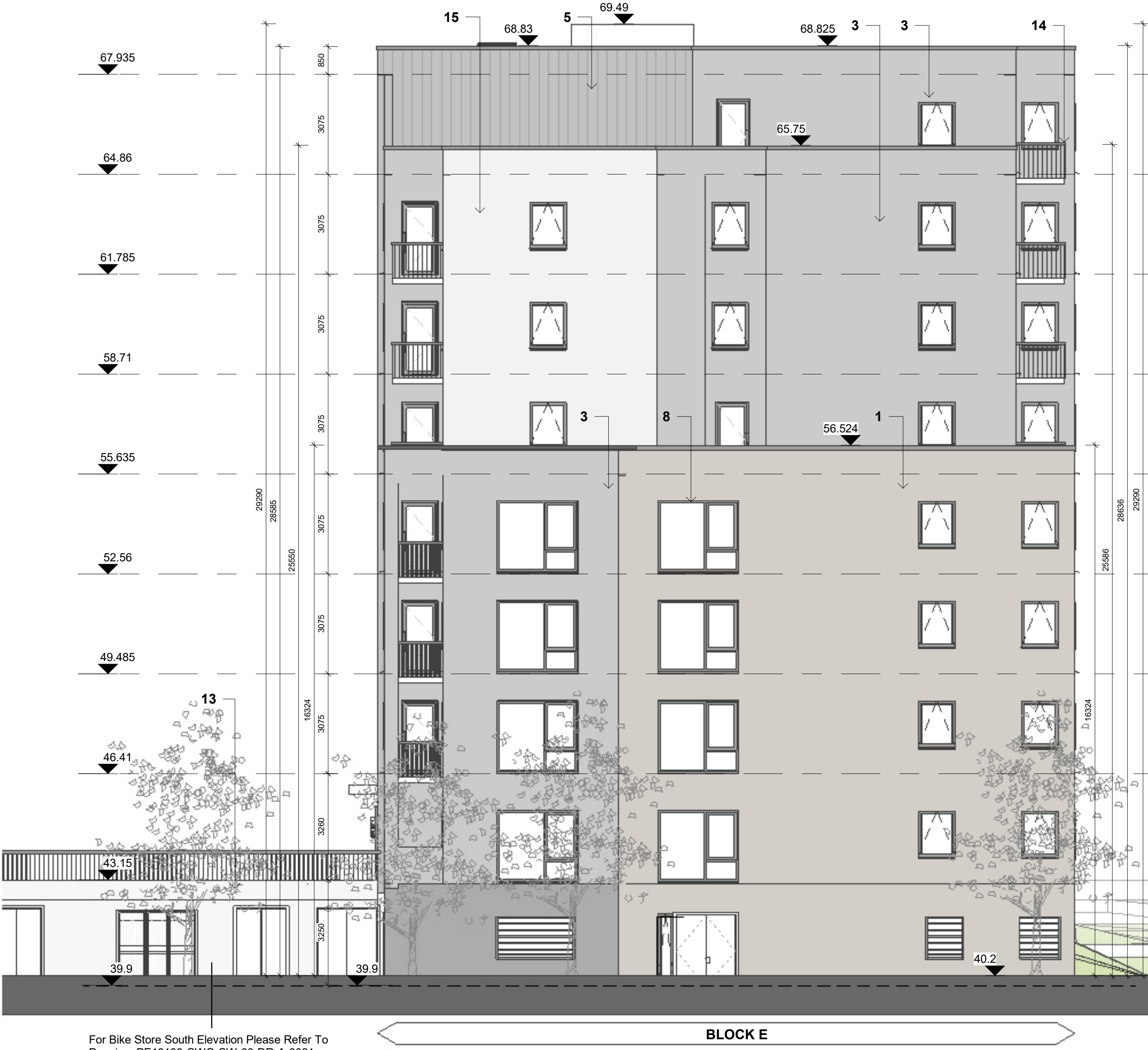
2 BLOCK E - PROPOSED SOUTH ELEVATION