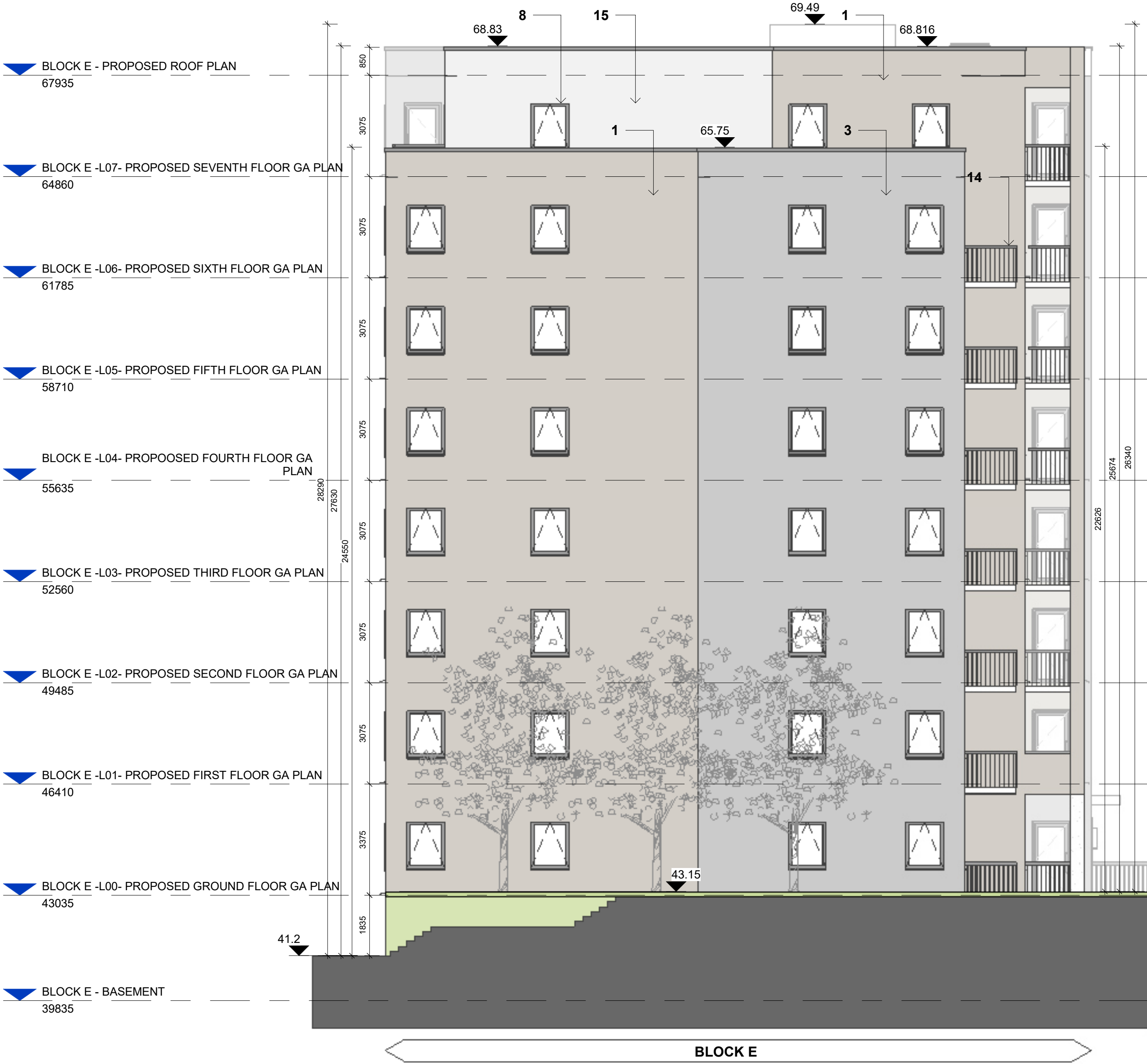
1 BLOCK E - PROPOSED NORTH ELEVATION

Please consider the environment before printing this sheet