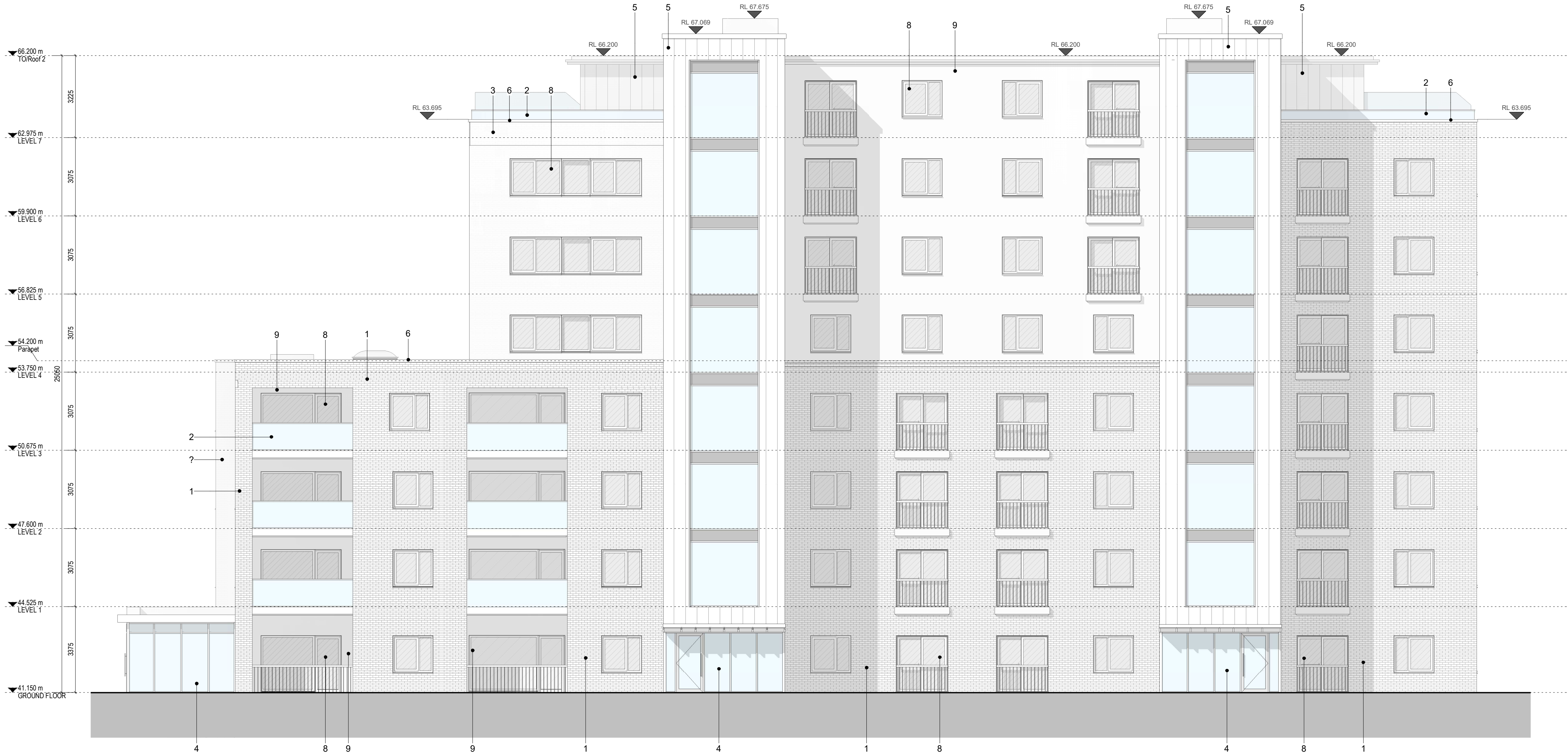
1 GA - East Elevation