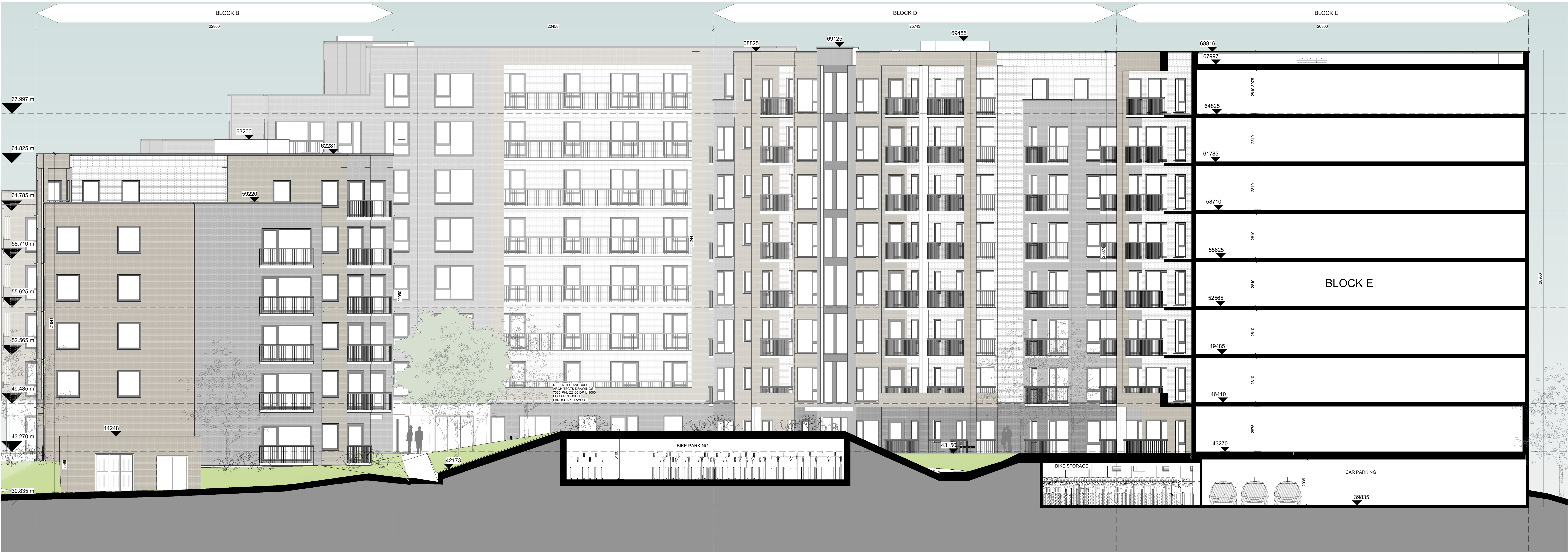
2 PROPOSED SITE SECTION - 2