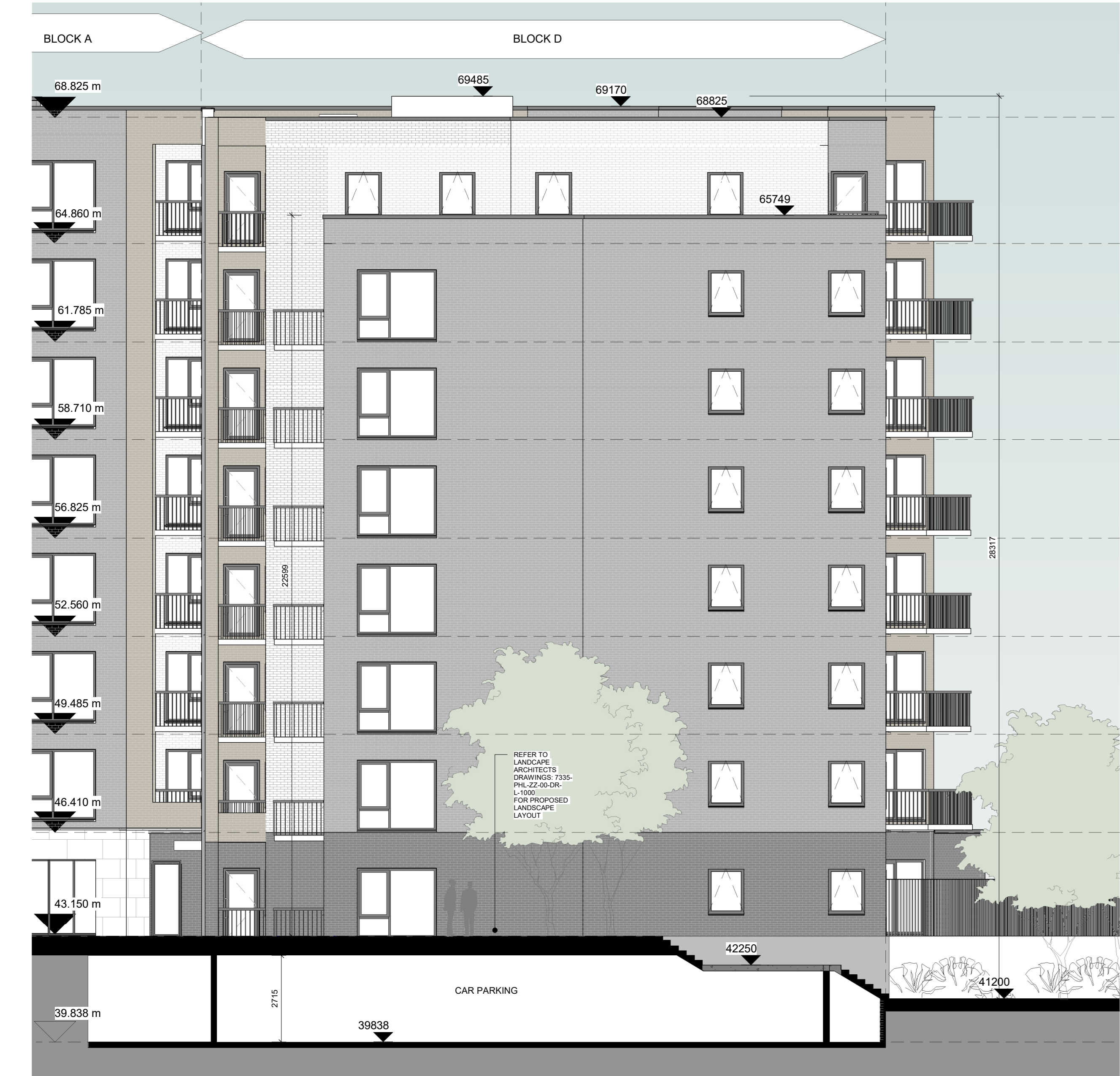
4 PROPOSED SITE SECTION - 4 1:100