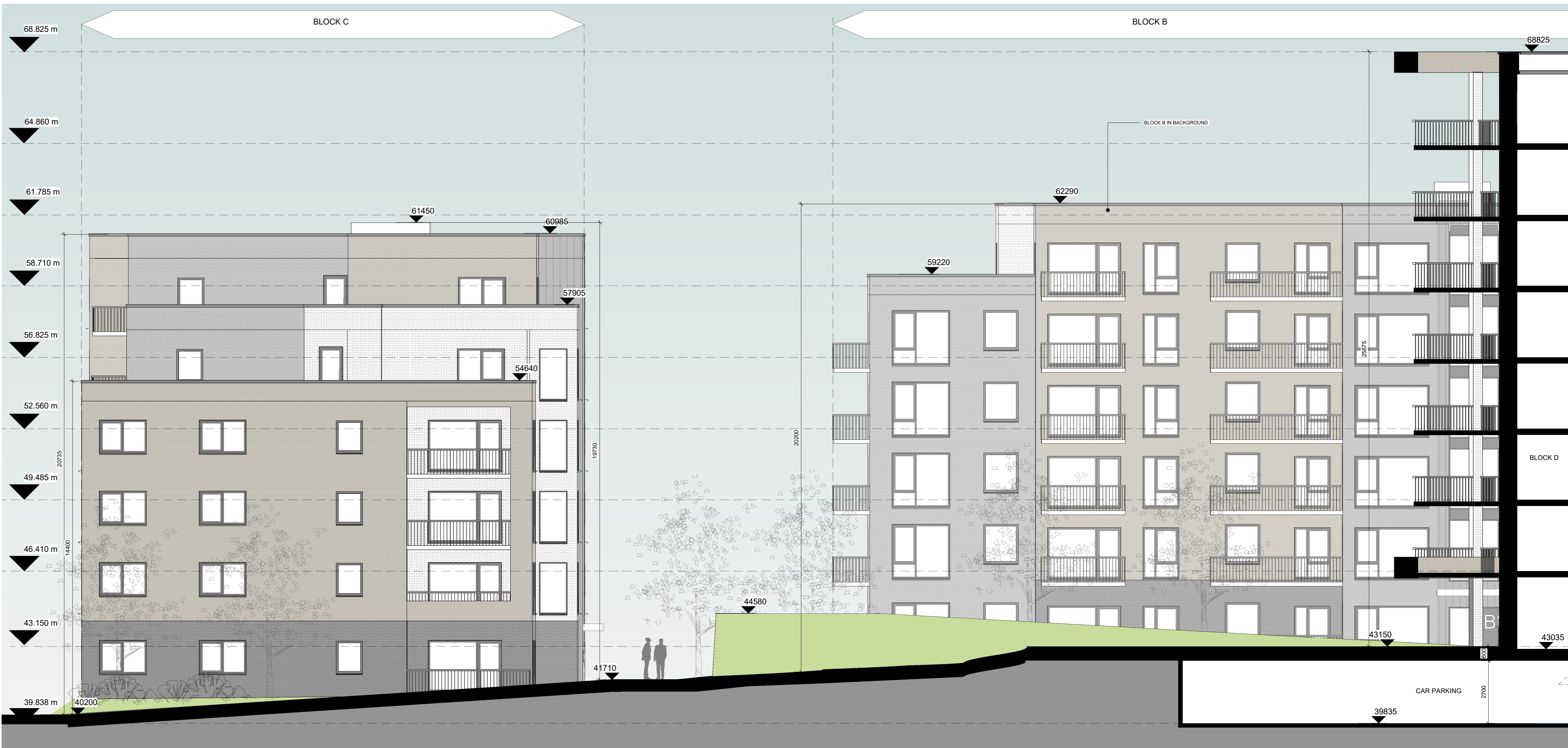
5 PROPOSED SITE SECTION - 5 1:100