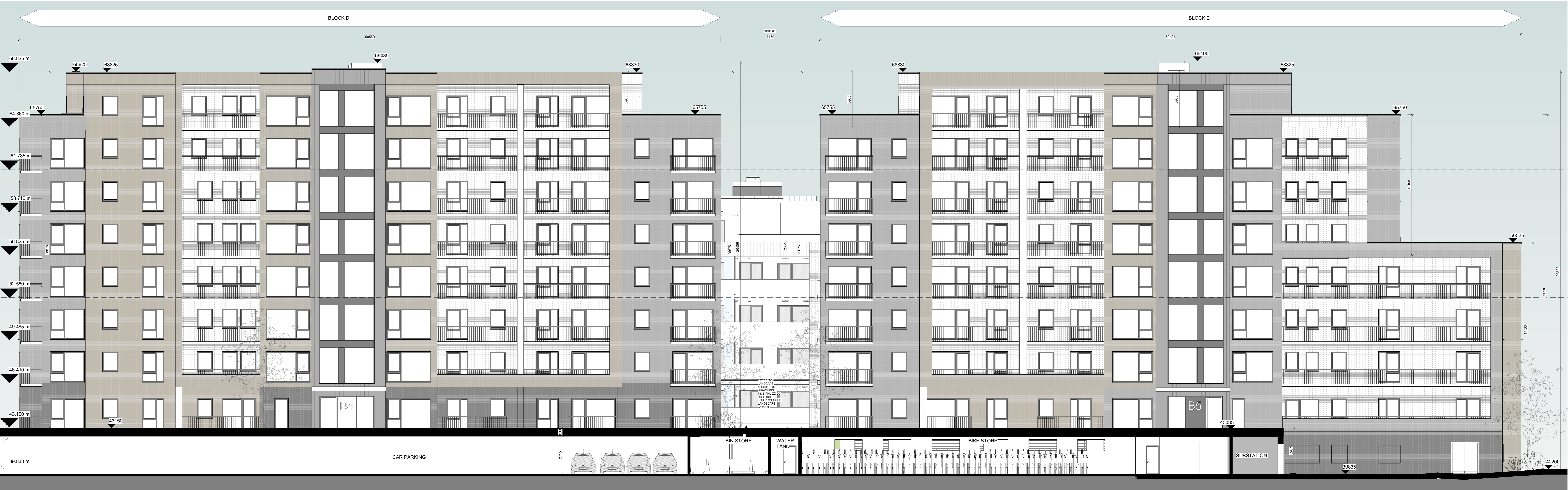
3 PROPOSED SITE SECTION - 3 1:100